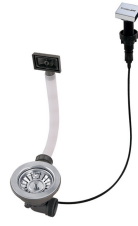
lira automatic waste fitting 8407 102