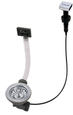
lira automatic waste fitting 8407 102