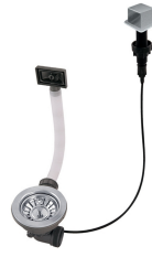
lira automatic waste fitting 8407 103