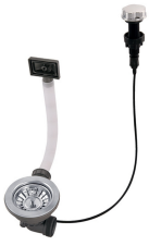
automatic waste fitting 8407 000