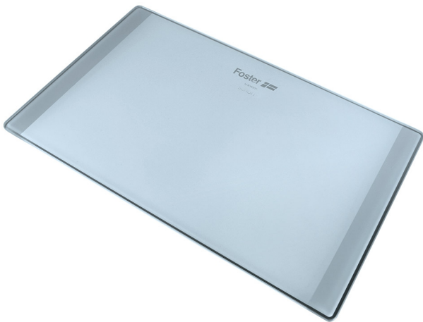
glass chopping board 8631 300