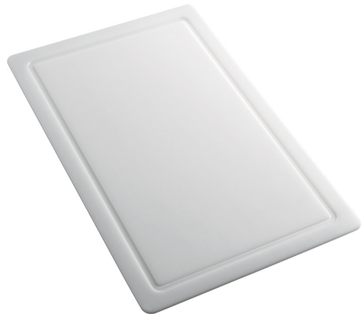
hdpe chopping board 8657 001