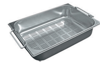
stainless steel colander 8154 000