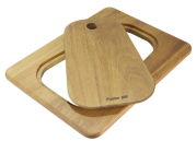
iroko-wood sliding chopping board 8644 041