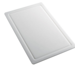
hpde chopping board 8657 001