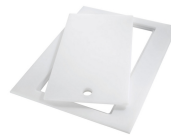
hpde twin chopping board 8644 101