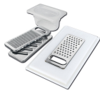
graters kit with ring-holder and food collection tray 8159 101