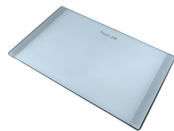
glass chopping board 8631 300