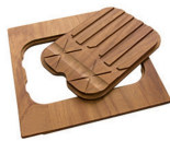
iroko-wood twin chopping board 8644 004