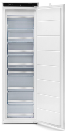
Refrigerator Refrigerator Code: 2039 000