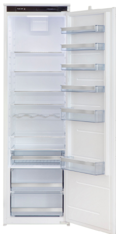
Refrigerator Refrigerator Code: 2038 000