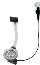
lira automatic waste fitting 8407 102