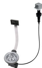
lira automatic waste fitting 8407 103