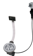
lira automatic waste fitting 8407 103