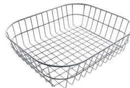
stainless steel basket 8611 000