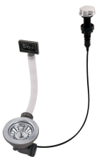
automatic waste fitting 8407 000