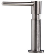
Dispenser Evo Satin