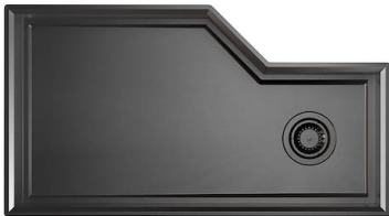
Sink Diade Gun Metal 3028 006