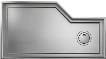
Sink Diade 3028 850