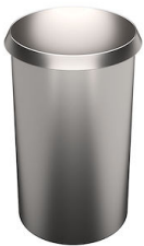
Bottle holder (USA)