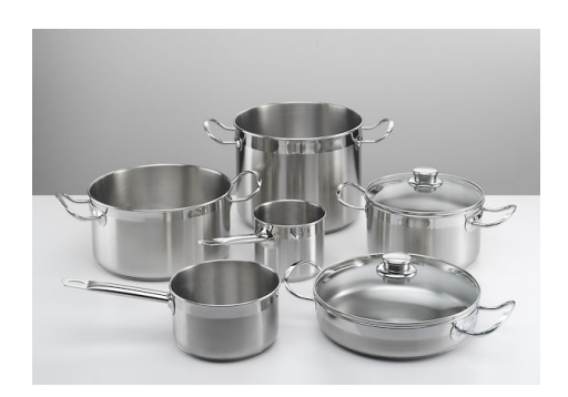
Induction Pro - Cookware set -8pcs