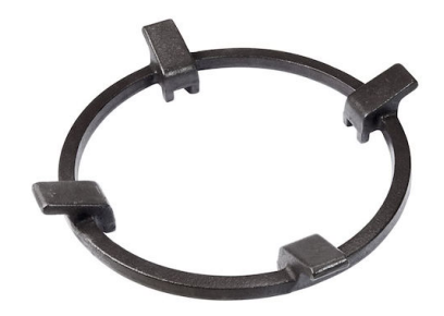
Cast iron wok support