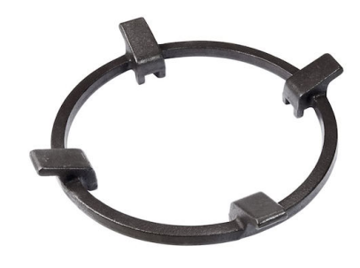
Cast iron wok support