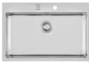
Sink KE Filotop