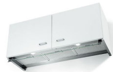
Hood New Wing 2512 072