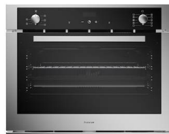
Oven KE 75 7137 000