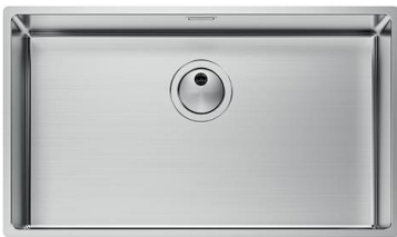
Sink S4001 3138 850