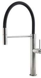
Mixer Tap Skin