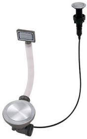
Space Push automatic waste fitting