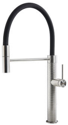
Mixer Tap Skin