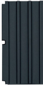
Cast iron pot support