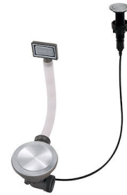
Space Push automatic waste fitting