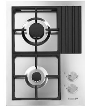
Cooker hob S4000 Domino