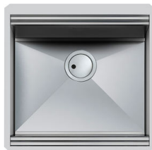
Sink Milanello Workstation