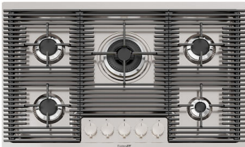
Cooker hob Milanello 5F