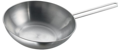
Induction Pro - Wok pan with flat bottom PRO