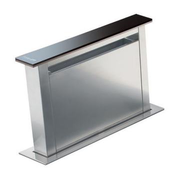
Hood S4000 Domino Ghost