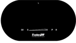
Cooker hob Touch Control Modular Induction 7368 040