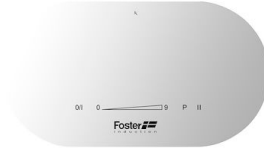
Cooker hob Touch Control Modular Induction 7368 045