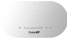
Cooker hob Touch Control Modular Induction