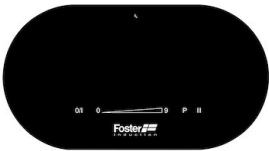
Cooker hob Touch Control Modular Induction