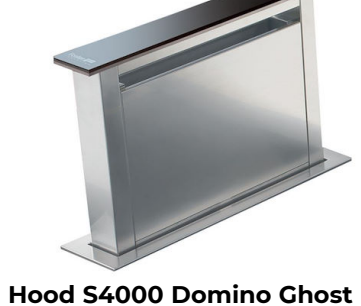
Hood S4000 Domino Ghost 2451 000