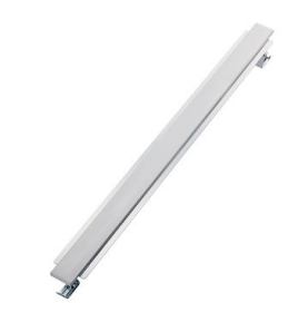
Spacer for Domino elements 8320 000