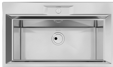
Sink FL 2976 060