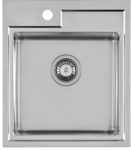
Sink Fortyfour 4151 050