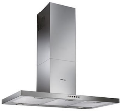
Hood KS 240_002