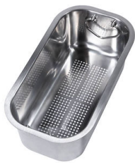
Stainless steel colander 8154 043