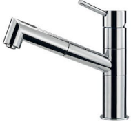
Mixer Tap F2000 - Basso