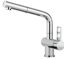
Mixer Tap Luisa