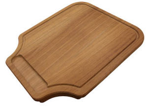
Iroko-wood chopping board