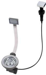
Automatic waste fitting 8407 113