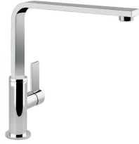
Mixer Tap NYC 8486 000