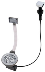
Automatic waste fitting