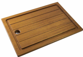
Iroko-wood chopping board