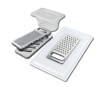
Graters kit with ring-holder and food collection tray