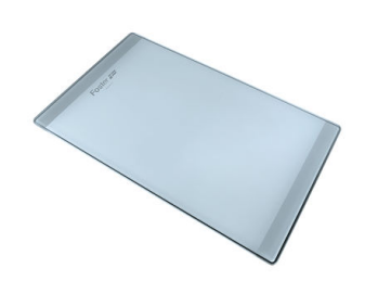
Glass chopping board