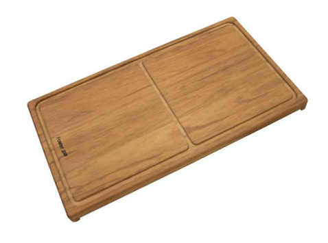
Iroko-wood sliding chopping board