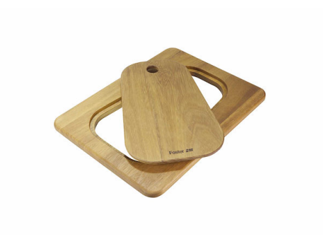
Iroko-wood sliding chopping board