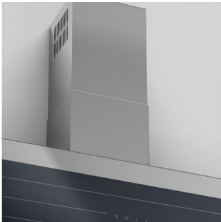
_telescopic chimney kit