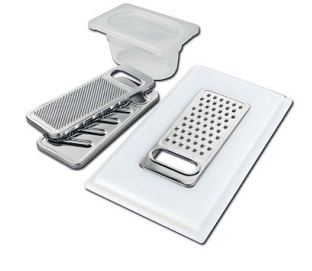
Graters kit with ring-holder and food collection tray