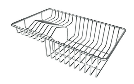
Stainless steel plate rack 8100 303 * only in combination with the accessory