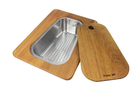
Iroko-wood chopping board with stainless steel colander