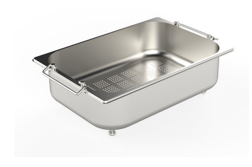
Stainless steel colander