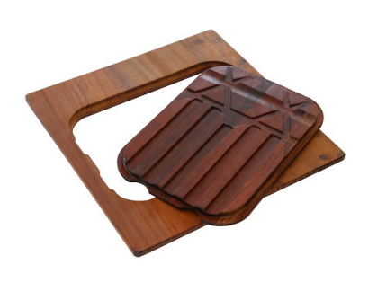
Iroko-wood twin chopping board