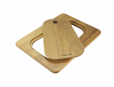
Iroko-wood sliding chopping board