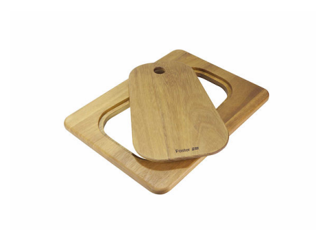
Iroko-wood sliding chopping board