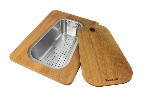
Iroko-wood chopping board with stainless steel colander