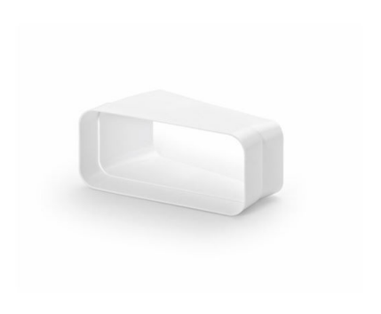
Horizontal 15° Corner connector - rectangular section