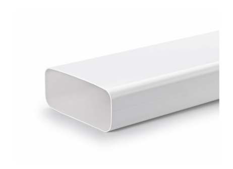
White tube - rectangular section