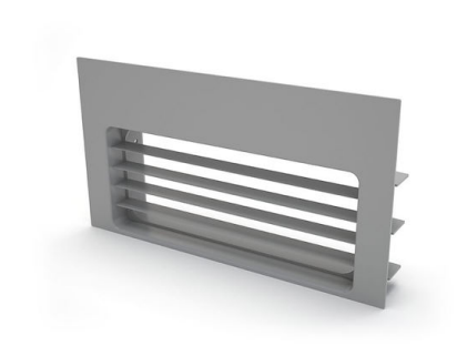
Grid for plinth gray color