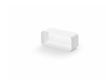
White connector - rectangular section