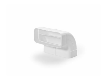
White Vertical 90° Corner connector - rectangular section