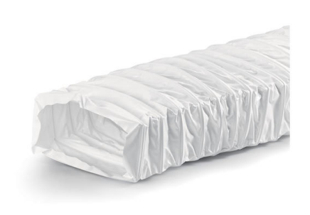
White flexible tube with rectangular section