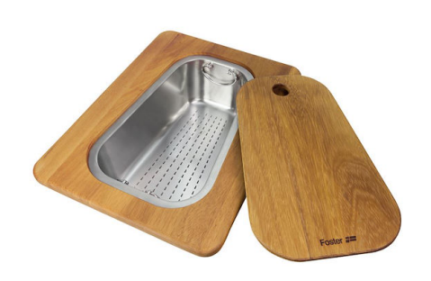
Iroko-wood chopping board with stainless steel colander