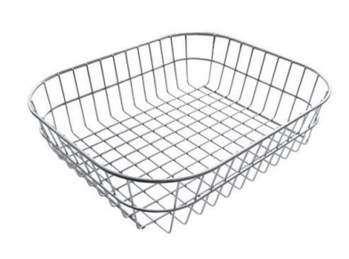
Stainless steel basket