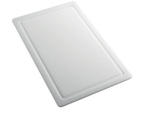
HPDE Chopping board