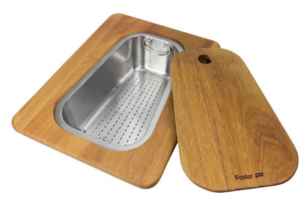
Iroko-wood chopping board with stainless steel colander