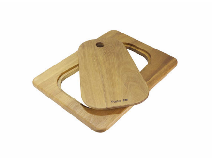
Iroko-wood sliding chopping board