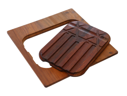
Iroko-wood twin chopping board 8644 004