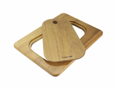
Iroko-wood sliding chopping board 8644 041