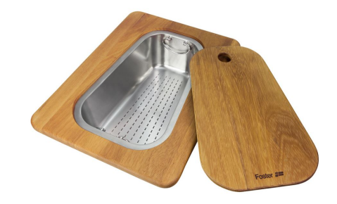
Iroko-wood chopping board with stainless steel colander 8644 042