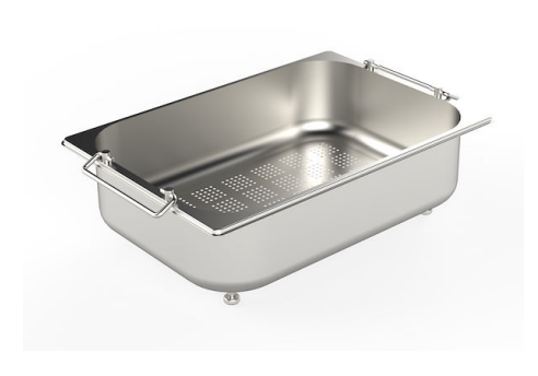
Stainless steel colander