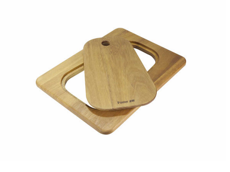
Iroko-wood sliding chopping board