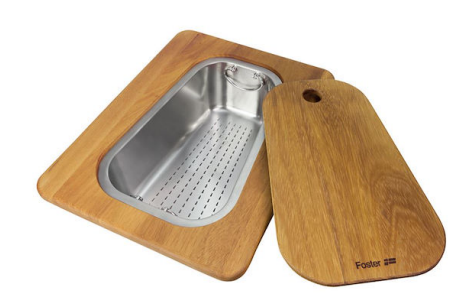
Iroko-wood chopping board with stainless steel colander