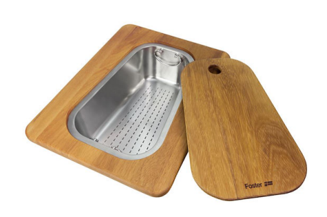
Iroko-wood chopping board with stainless steel colander