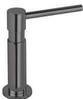
Dispenser Evo Gun Metal 8520 856