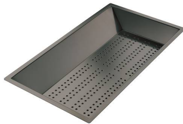
Stainless steel perforated tray PVD Gun Metal 8151 006 * only in combination with the accessory 8644 101