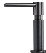
Dispenser Evo satin Gun Metal 8520 156