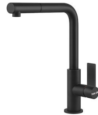
Mixer Tap Omega Plus Matt Black 8498 626