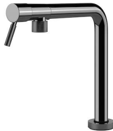
Mixer Tap Margot Gun Metal 8524 006