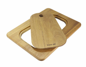
Iroko-wood sliding chopping board