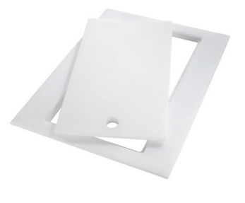
HPDE Twin chopping board