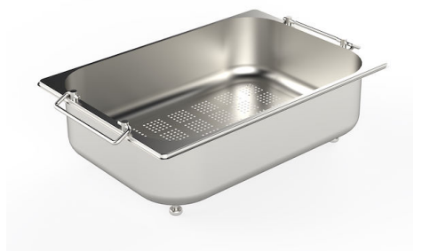
Stainless steel colander