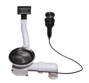
Space Push Gun Metal automatic waste fitting