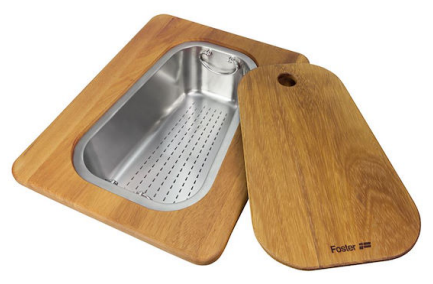
Iroko-wood chopping board with stainless steel colander