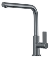
Mixer Tap Omega Gun Metal