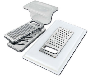
Graters kit with ring-holder and food collection tray