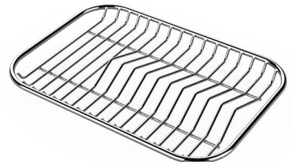
Stainless steel plate rack only usable in combination with the accessories 8644 003 8100 154