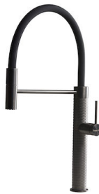
Mixer Tap Skin Gun Metal