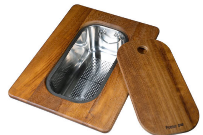
Iroko-wood sliding chopping board with stainless steel colander 8644 044

* only in combination with the accessory 8644 101