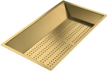
Stainless steel perforated tray PVD Gold