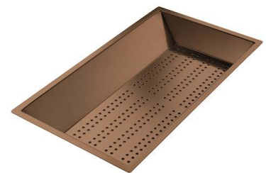
Stainless steel perforated tray PVD Copper 8151 008 * only in combination with the accessory 8644 101