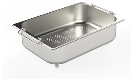
Stainless steel colander