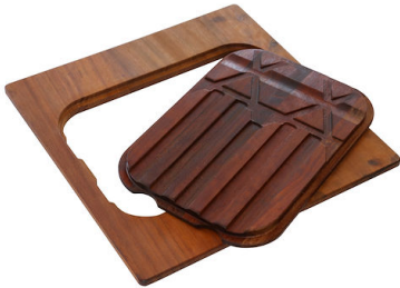
Iroko-wood twin chopping board