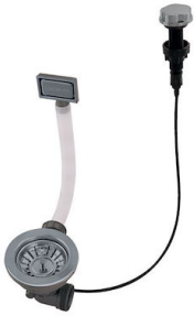
Gun Metal automatic waste fitting