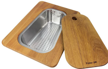
Iroko-wood chopping board with stainless steel colander