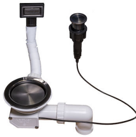
Space Push Gun Metal automatic waste fitting