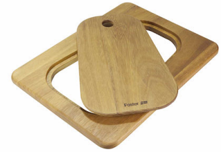
Iroko-wood sliding chopping board