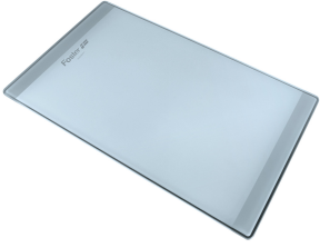
Glass chopping board 8631 300